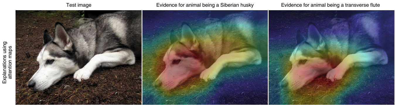
Fig. 2 | Saliency does not explain anything except where the network is looking. We have no idea why this image is labelled as either a dog or a musical instrument when considering only saliency. The explanations look essentially the same for both classes.